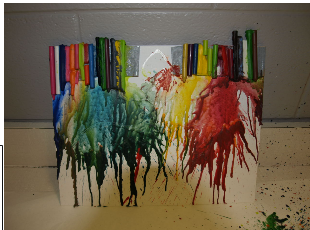
Right: wax painting created by JDLA elementary students.