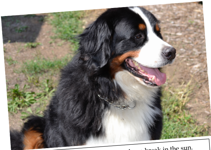
Above: Cristo, JDLA's therapy dog, takes a break in the sun.