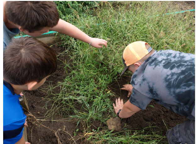
Above: students prepare the JDLA garden for fall planting.